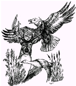
Friends of Boyer Chute & DeSoto National Wildlife Refuge

Ride objective - raise community awareness of the recreational opportunities available at Boyer Chute NWR. 2009 Bike to Boyer fundraising proceeds will be used to replace the Meadowlark Environmental Education shelter roof.