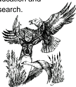
Friends of Boyer Chute & DeSoto National Wildlife Refuge

Friends' Group Mission - To support the Boyer Chute and DeSoto National Wildlife Refuges in their efforts to preserve, protect, and restore the biological diversity and historical resources of the Refuges, while providing the opportunity for wildlife oriented activities, education and scientific research.